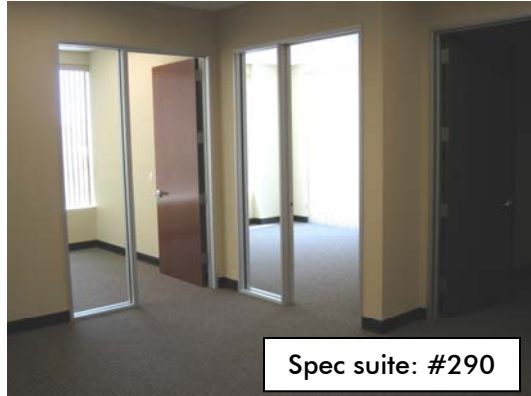
Spec suite: #290