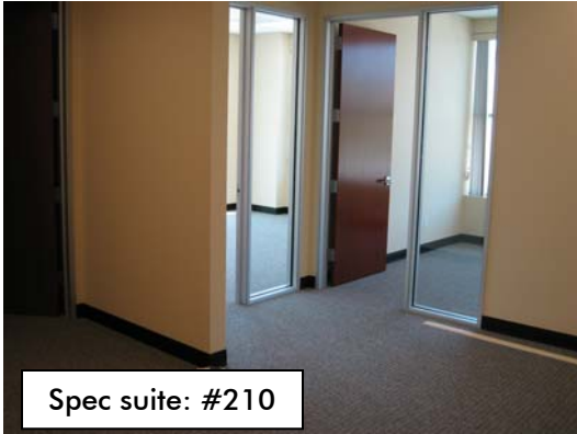
Spec suite: #210